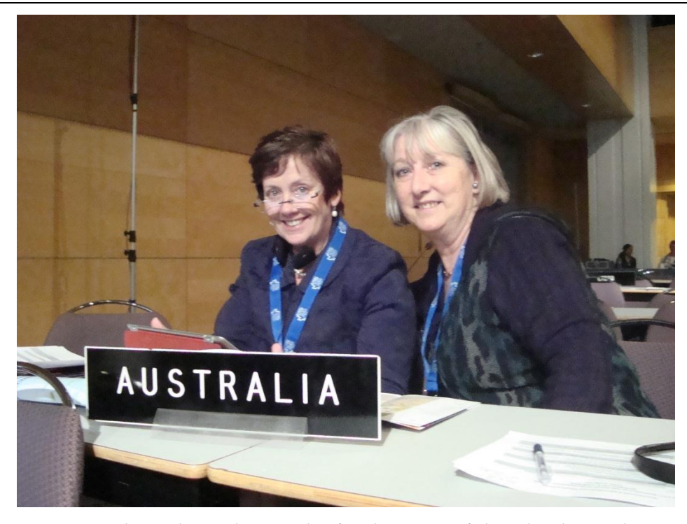
Senator's Boyce and Stephens during the final sitting of the Third Standing Committee