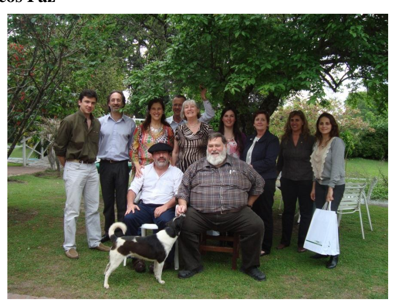
The delegation with the Mayor of Marcos Paz