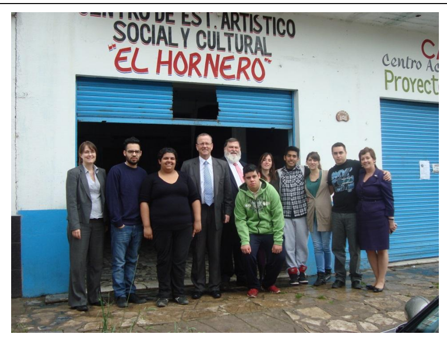
The delegation with coordinators and participants in the Direct Aid Project El Honero

6.38 The delegation was pleased to note that the project was seeking to continue its work beyond the term of the DAP funding arrangements by drawing on the skills and initiative of the young people themselves. The delegation welcomed this opportunity to see firsthand the significant impact that small amounts of Australian aid can have within a community.