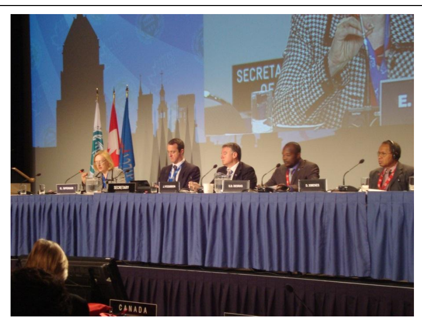
The Hon Mr Joel Fitzgibbon MP chairing the a session of the IPU Committee on United Nations Affairs